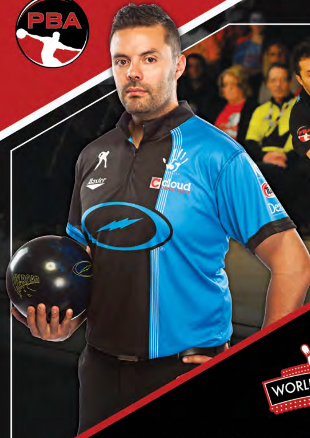
TWO-TIME PBA Player of the Year Jason BELMONTE

ALL TICKETS AVAILABLE AT PBA.COM/TICKETS